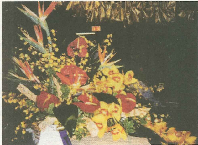
PAGE 12 Shrewsbury Flower Show