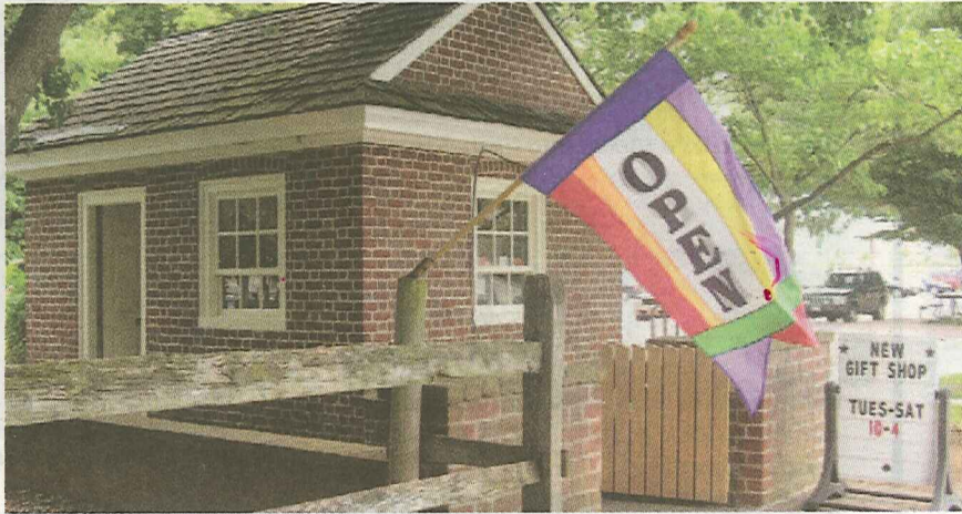
PAGE 12 Colonial Gift Shop Opens