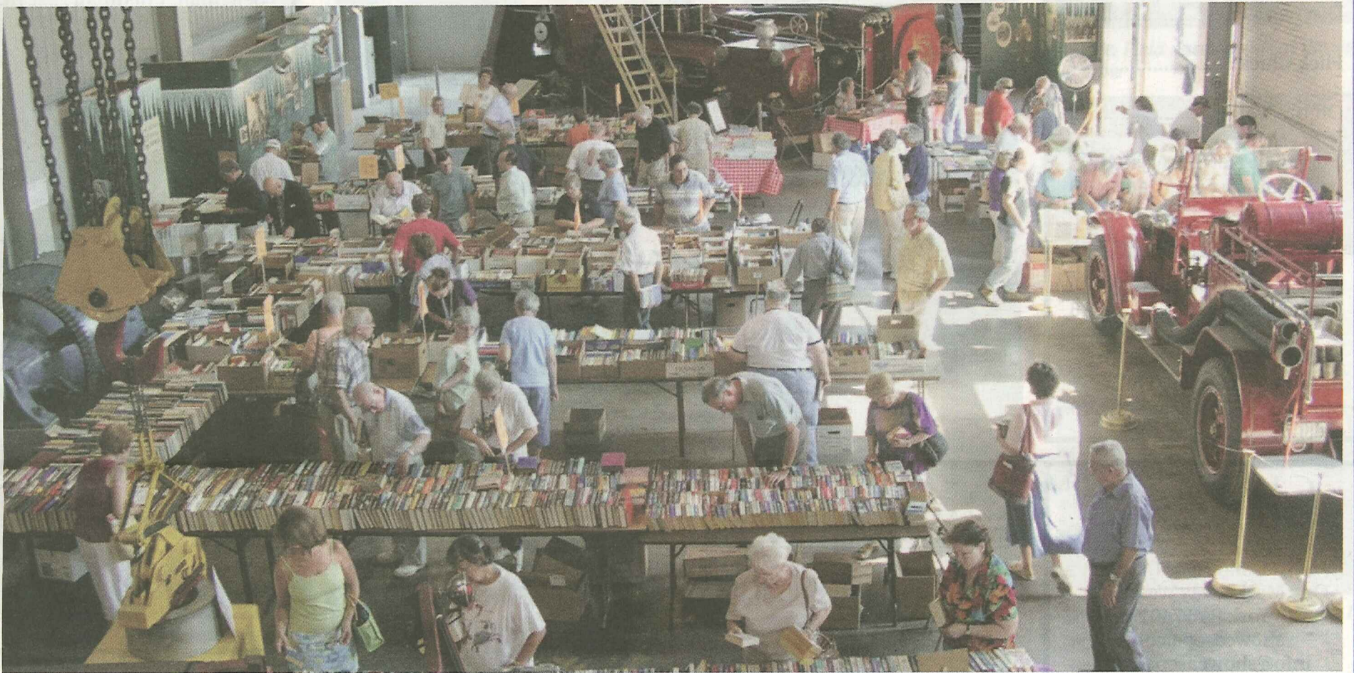
PAGE 10 Book Blast