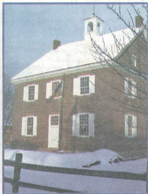
Colonial Courthouse

In next month's installment, we'll continue with the Victorian period and conclude with the early and mid 20th Century.