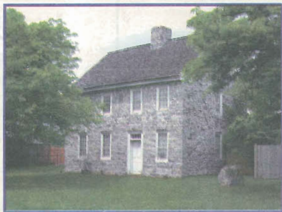
Cookes House