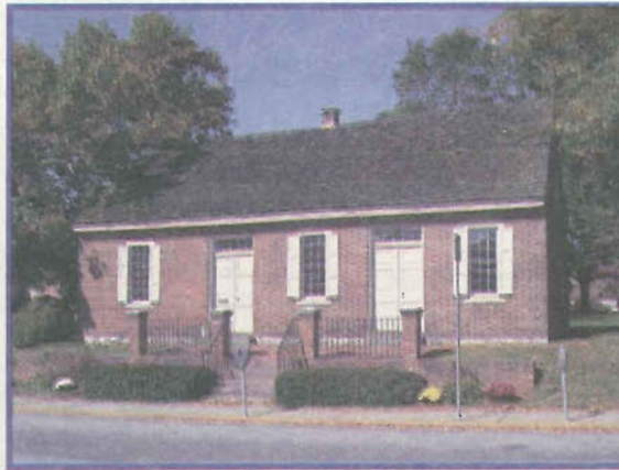
Friends Meeting House

There are over a dozen buildings in the City of York that date from the 1700s - and many more in the surrounding areas; however, York didn't really "come of age" until the 1800s. While the phrase "Colonial York" was formerly used to