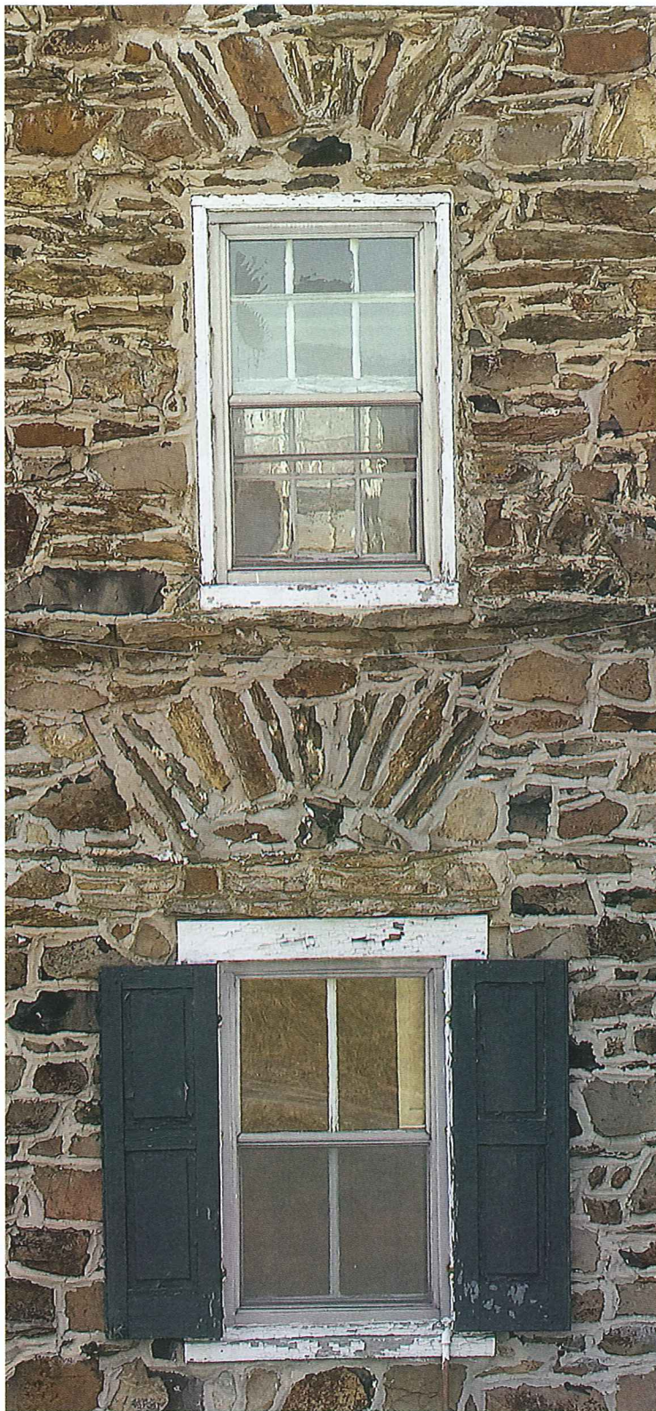
Currently owned by Historic York and unoccupied, the Schultz House’s future is unclear.