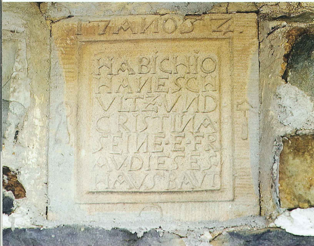
A date stone seems to say the Schultz House was built in 1734. Recent research puts the date about a decade later.

The intensity of the work is easily seen in the attic, where large, rough beams support the roof. A curved stairway with narrow steps extends from the second floor.